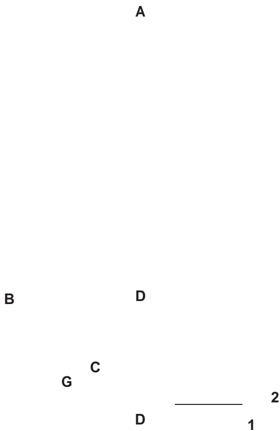
Figure 1: Indoor Pitch